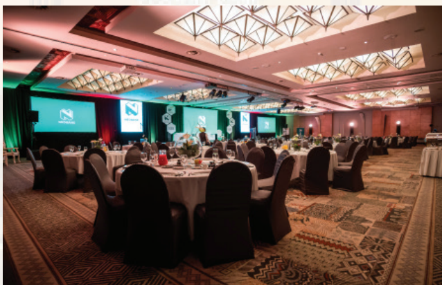
ORYX 1, 2 & 3